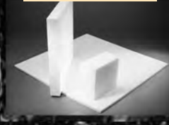
Molded PTFE Sheet