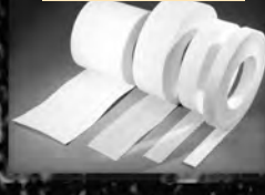
Skived PTFE Tape