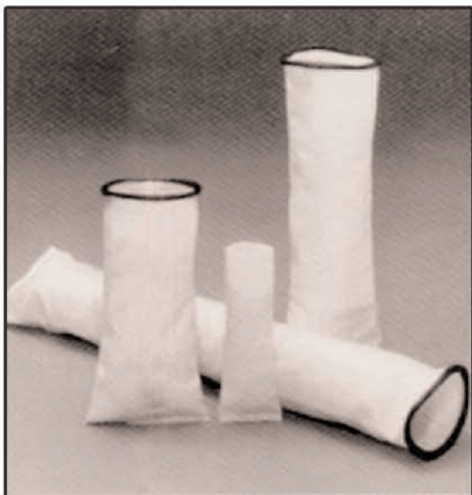
High-strength reusable bag filters